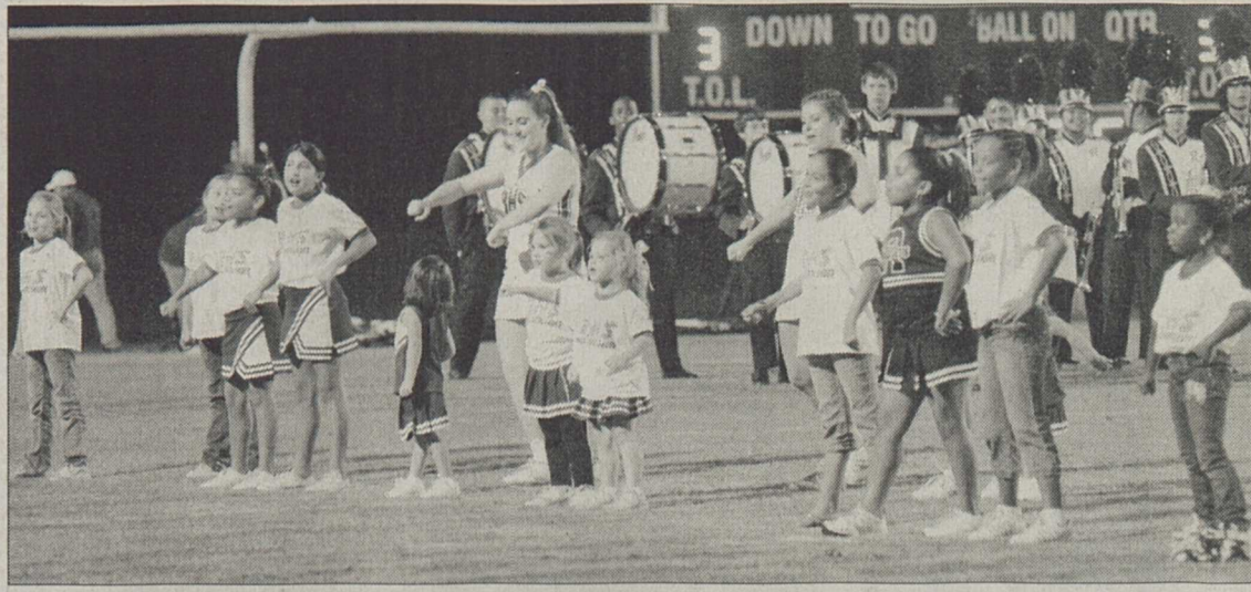
Participants in the Raiders Cheerleading Camp last Summer performed several cheers during halftime of the Weimar game.